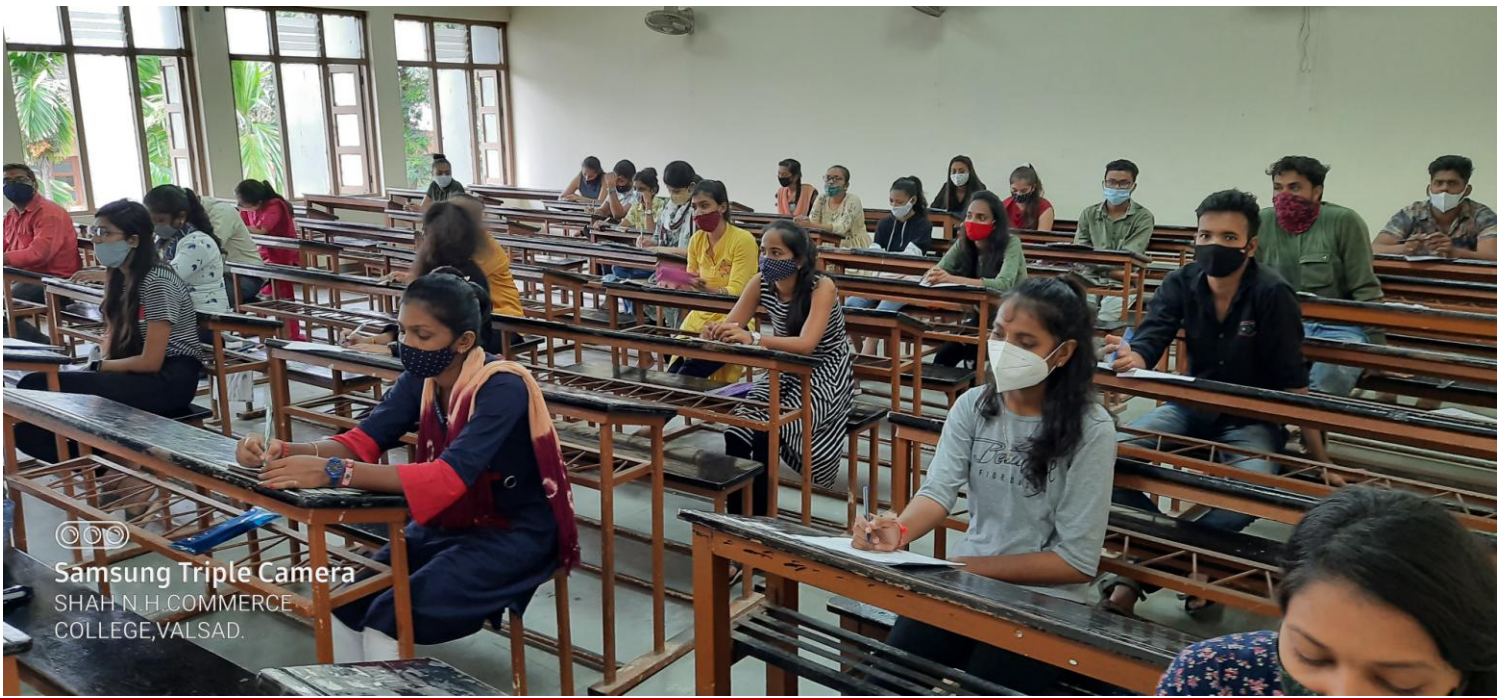
©©© Samsung Triple Camera SHAH N.H.COMMERCE COLLEGE,VALSAD.