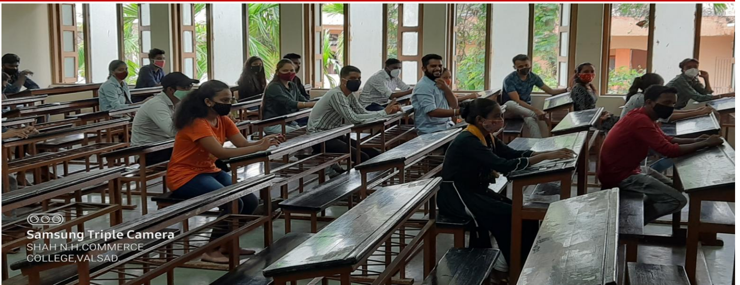
©©© Samsung Triple Camera SHAH N.H.COMMERCE COLLEGE,VALSAD.