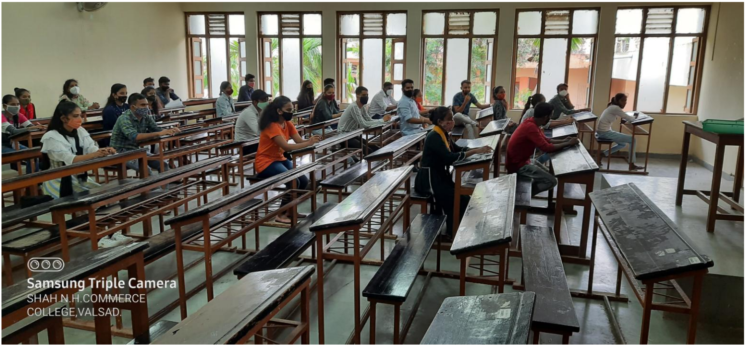
©©© Samsung Triple Camera SHAH N.H.COMMERCE COLLEGE,VALSAD.