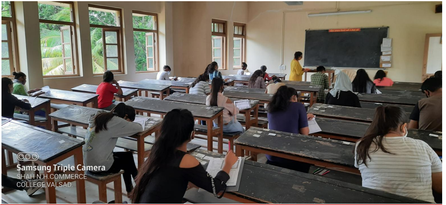
©©© Samsung Triple Camera SHAH N.H.COMMERCE COLLEGE,VALSAD.