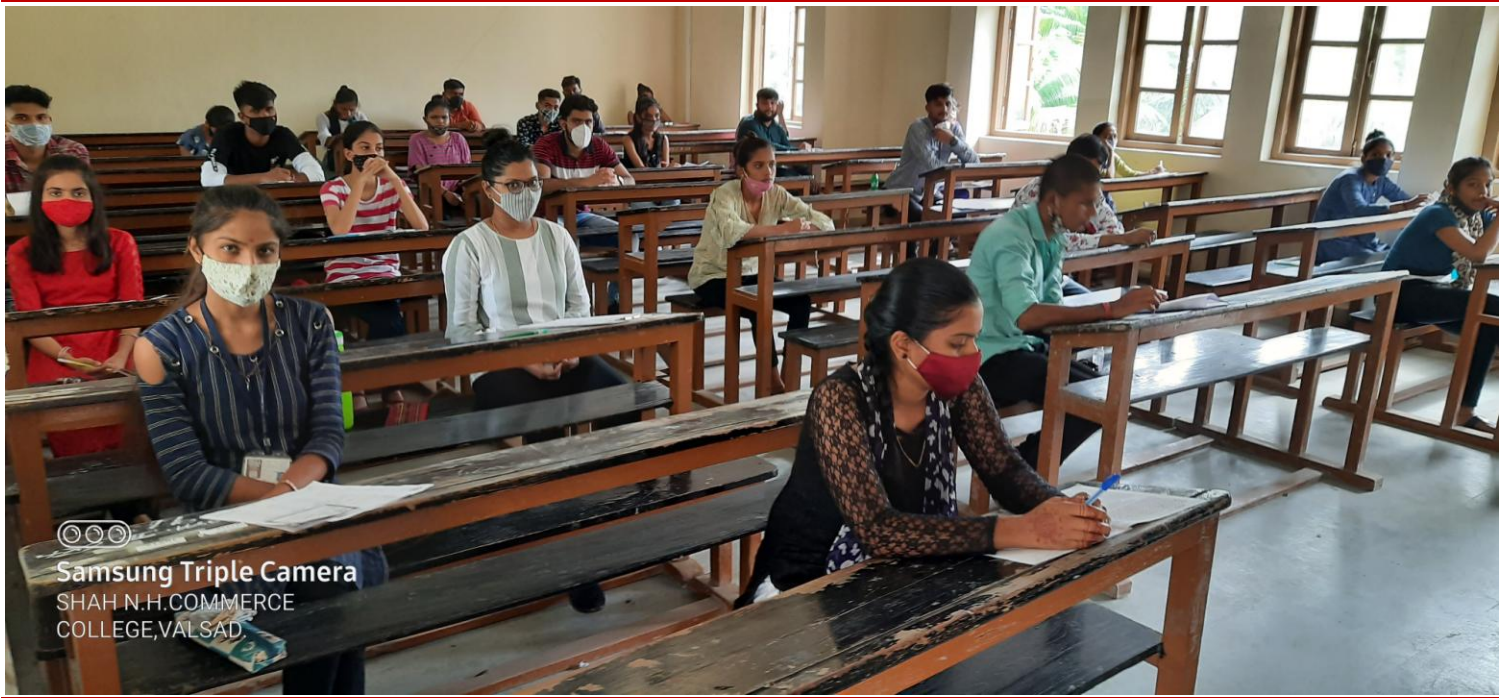
©©© Samsung Triple Camera SHAH N.H.COMMERCE COLLEGE,VALSAD.